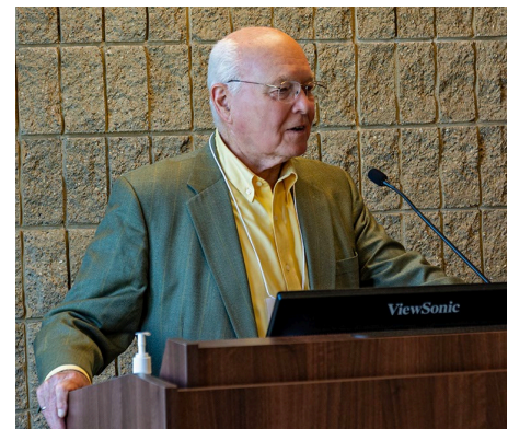
Me, welcoming NEO members at our October lecture.

NEO Programming for the next two quarters is detailed on page 10 in this newsletter. Events are to be held at several different locations, and the presentations will continue to be on subjects that span many interests. Access to venues, including parking, is a concern. Costs for meals, services, and space remain a major factor in this planning. Expenses have risen faster than in past years (this is not news to anyone), but our allocation from the University hasn't changed. It's one of the on-going challenges.