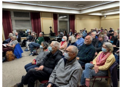
Full house! With many more attending via Zoom.