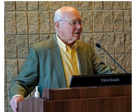
Me, welcoming NEO members at our October lecture.

NEO Programming for the next two quarters is detailed on page 10 in this newsletter. Events are to be held at several different locations, and the presentations will continue to be on subjects that span many interests. Access to venues, including parking, is a concern. Costs for meals, services, and space remain a major factor in this planning. Expenses have risen faster than in past years (this is not news to anyone), but our allocation from the University hasn't changed. It's one of the on-going challenges.