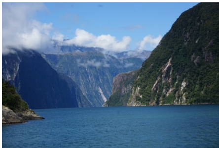
Milford Sound.

Onward to Arthur's Pass where we hiked for miles in the wilderness, then to Nelson, in wine country where we sampled the local products. We took kayak rides in Abel Tasman Park into the Pacific Ocean and then hiked in the park where no cars are allowed.