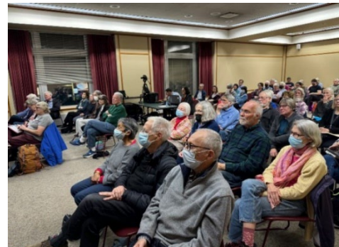
Full house! With many more attending via Zoom.